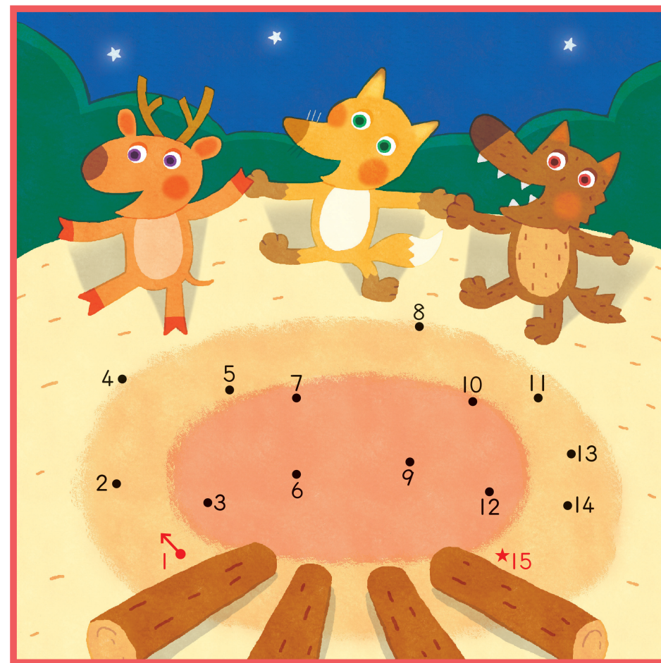
"My Book of Numbers 1-10" © 2018 by Kumon Publishing Co., Ltd. All rights reserved.